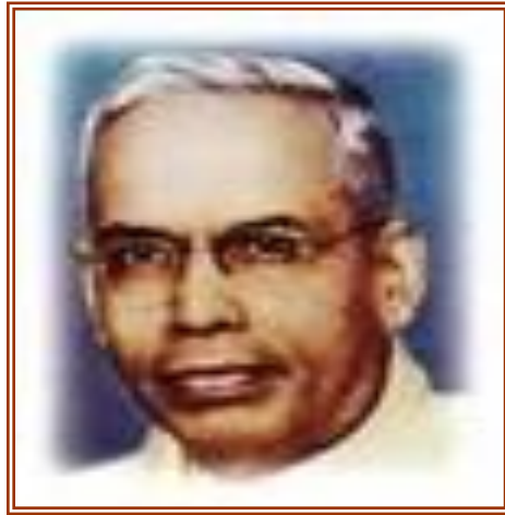
Dr. S.R. Ranganathan